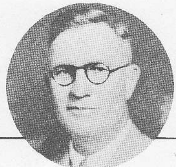
JUDGE BALLARD COLDWELL