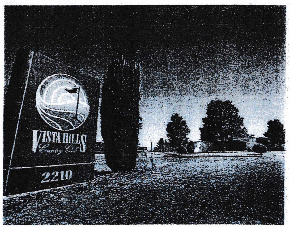
Vista Hills Country Club sits vacant at 2210 Trawood Dr. in El Paso.